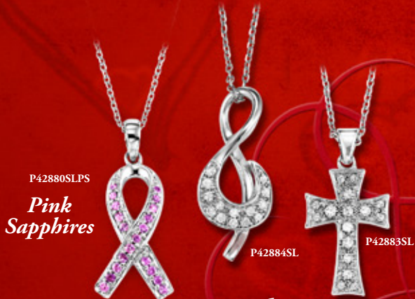
Your Choice Sterling Silver Pendants $149