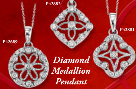
Diamond Medallion Pendant $649