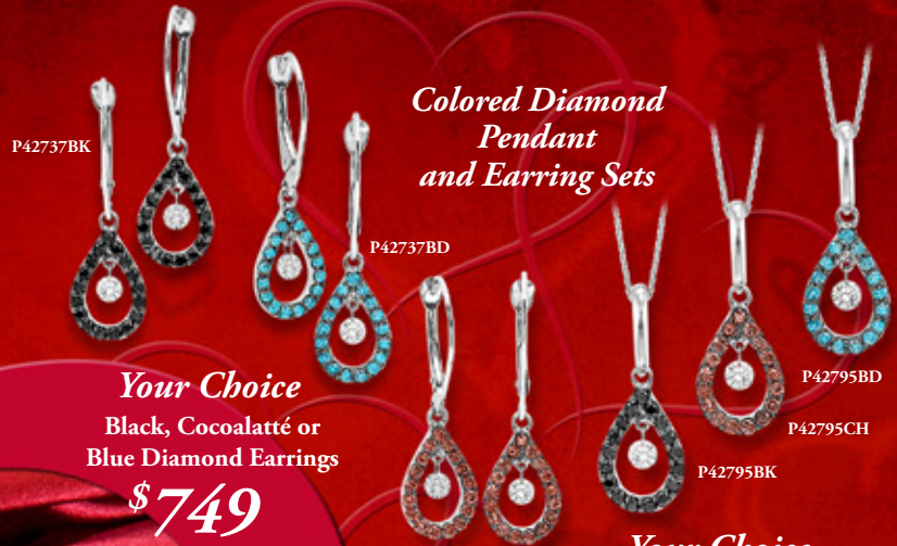
Colored Diamond Pendant and Earring Sets