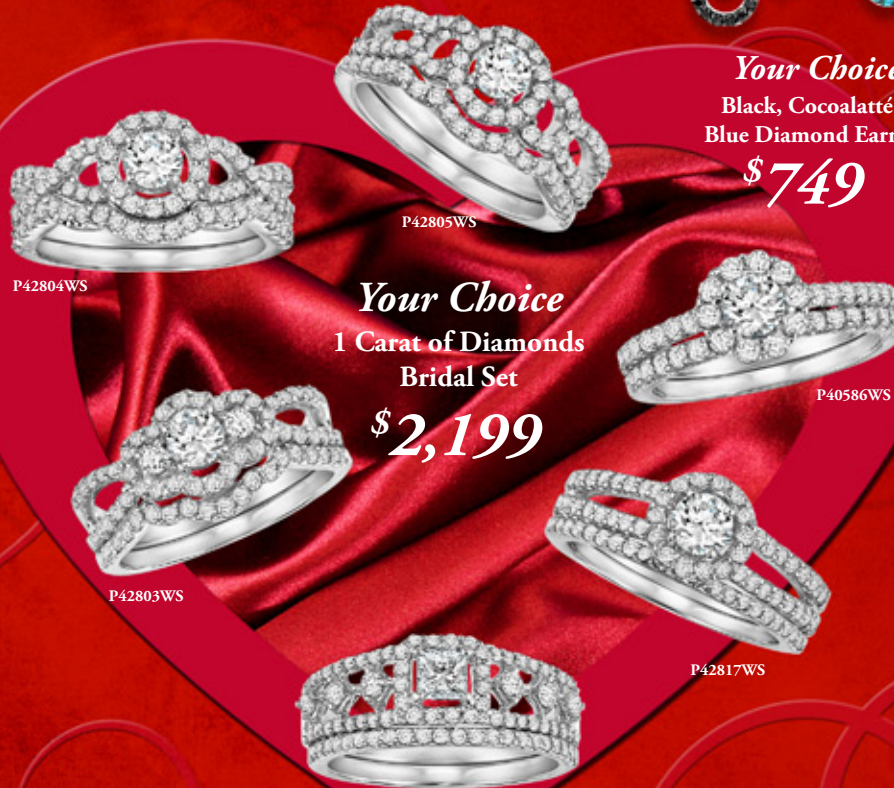
Your Choice 1 Carat of Diamonds Bridal Set $2,199