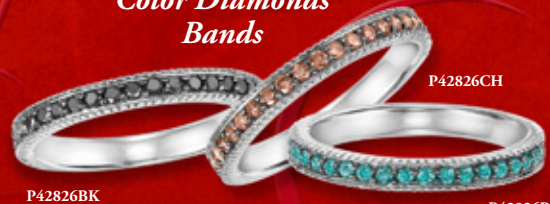
Your Choice Black, Cocolatté or Blue Diamond Bands $599