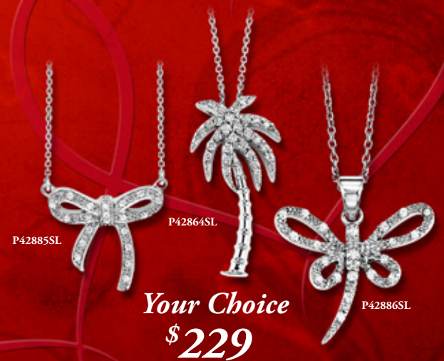
Your Choice $229