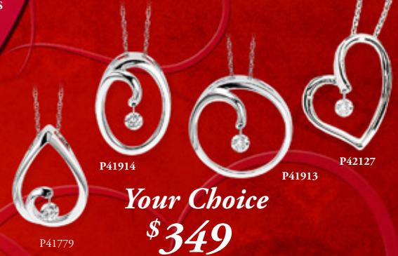
Your Choice $349