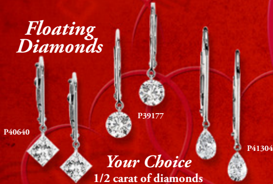
Your Choice 1/2 carat of diamonds Princess Cut, Round or Pear Shape Floating Studs $1099